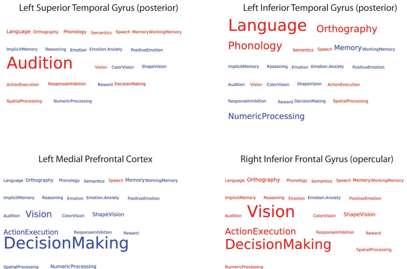
Fig. 1. Loading of several individual regions onto mental concepts was computed by projecting the average activity for each of the eight tasks in the Poldrack et al. (2009) data set onto a matrix describing the relation between tasks and mental concepts. Strength of loading is depicted using a tag cloud, with the size of the term representing the strength of the loading and the color of the term representing positive (red) or negative (blue) loading. The upper panels depict reasonable loadings of basic processes onto cortical regions, given the known function of those regions. The bottom left panel shows predictable negative signals associated with decision making in the medial prefrontal region, which is known to exhibit deactivation across a wide range of cognitive tasks (Gusnard, Akbudak, Shulman, & Raichle, 2001). The bottom right shows the pattern for right inferior frontal operculum, which shows an unexpected pattern with strongest loading on vision.

aims to develop a comprehensive and current ontology for mental processes. The goal of the project is to provide a knowledge base that describes the “parts” and processes of the mind, just as the gene ontology describes the component parts and functions of a cell. Doing this in the context of psychology is substantially more difficult than in the context of biology; in particular, whereas most biologists agree in large part on the ontology of the cell, there are few psychological processes or entities whose existence is uncontroversial. The goal of the Cognitive Atlas is to allow the representation of these concepts in a way that captures the disagreement that is certain to occur among cognitive scientists as they discuss the structure of mental processes.