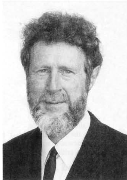
James R. Flynn

sample and therefore scored 100 easily exceeded the performance of a 1947 sample and therefore scored 108. Clearly from one sample to the other, over a period of 25 years, Americans had gained 8 IQ points.